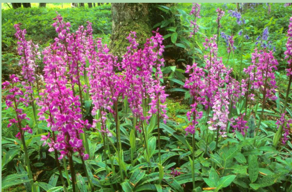
Early purple orchid, Bentley Wood